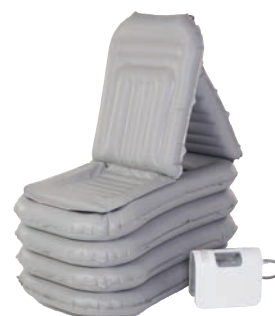
MANGAR Eagle Lifting Cushion