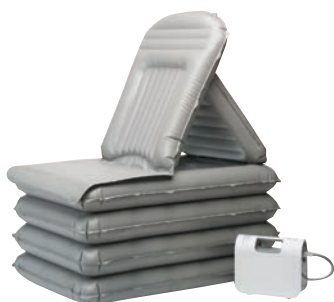
MANGAR Camel Lifting Cushion