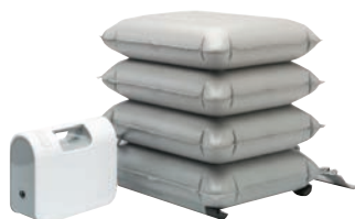
MANGAR ELK Lifting Cushion