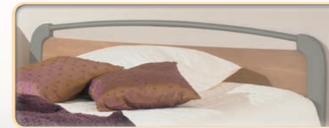
Auzence II board, available in 140 and 160 cm.