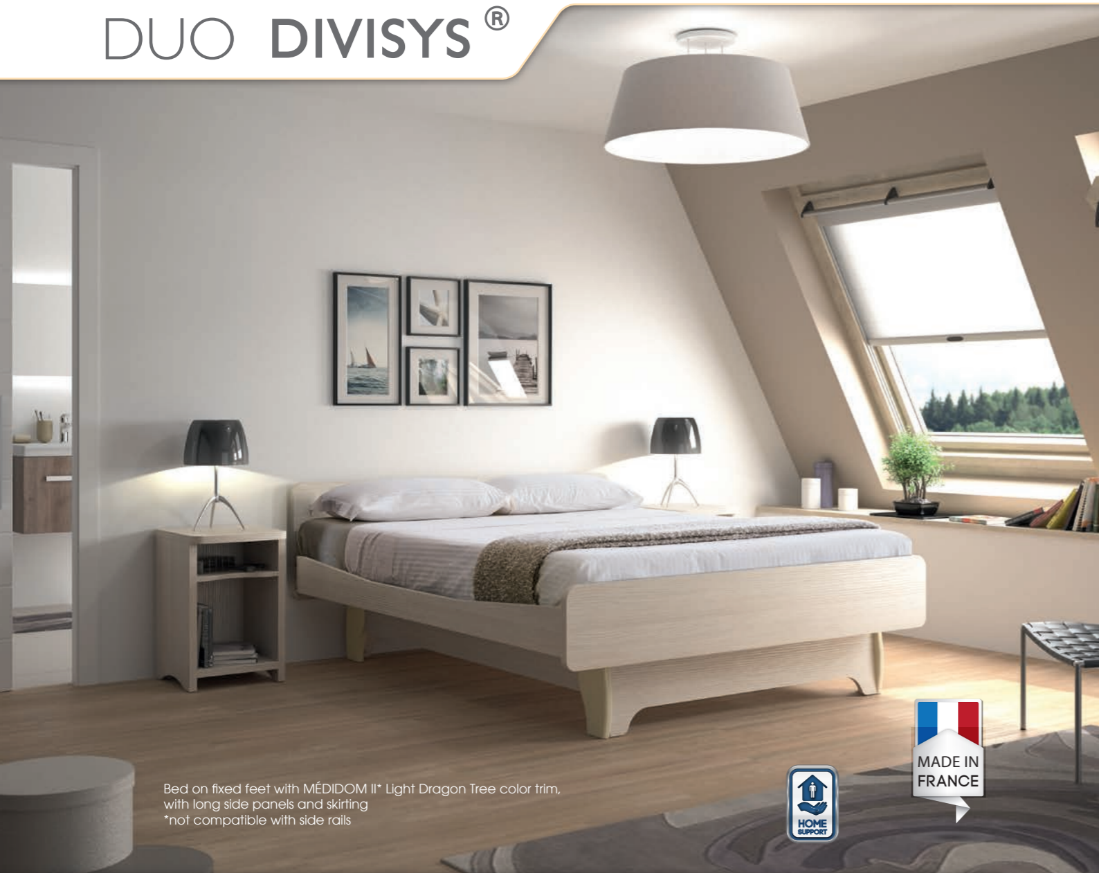
Bed on fixed feet with MÉDIDOM II* Light Dragon Tree color trim, with long side panels and skirting *not compatible with side rails