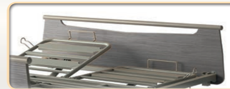
Abélia II board, available in 140 and 160 cm.

Bed on fixed feet with MÉDIDOM II* Grey Dragon Tree color trim, with long side panels and skirting. *incompatible with rails.