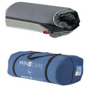
Delivered in a transport bag